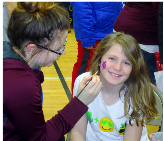
Face Painting at the PTO Carnival