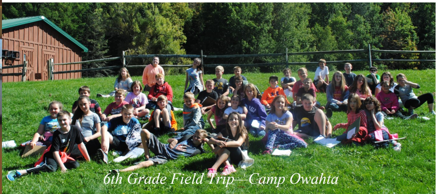
6th Grade Field Trip—Camp Owahta