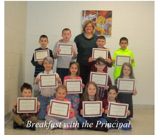
Breakfast with the Principal