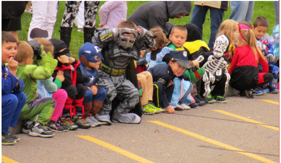
Elementary Halloween Parade