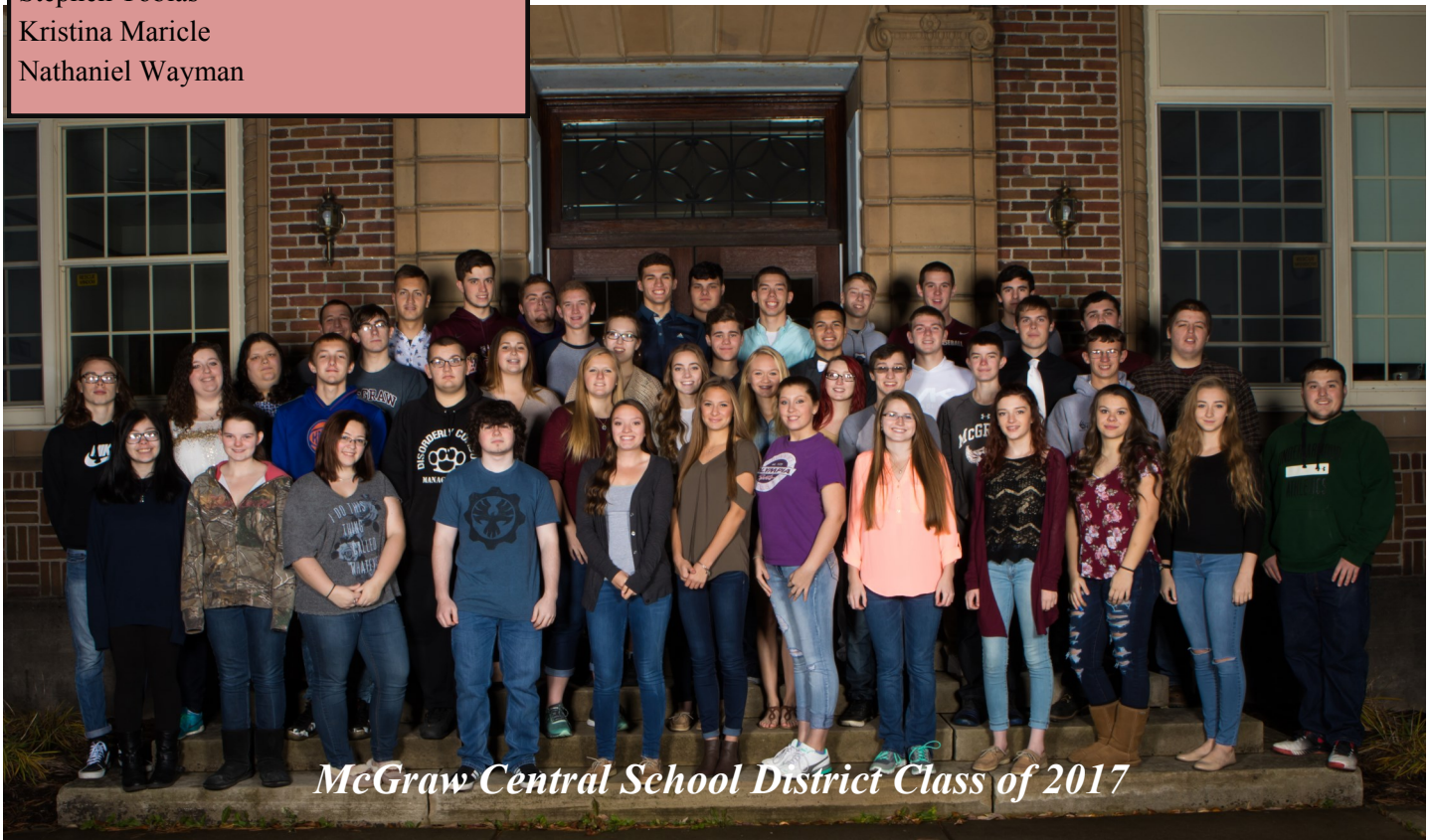
McGraw Central School District Class of 2017