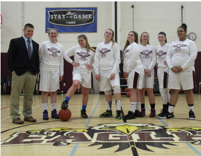
Girls Varsity Basketball

“Always go with the choice that scares you the most, because that’s the one that is going to help you grow.” - Caroline Myss