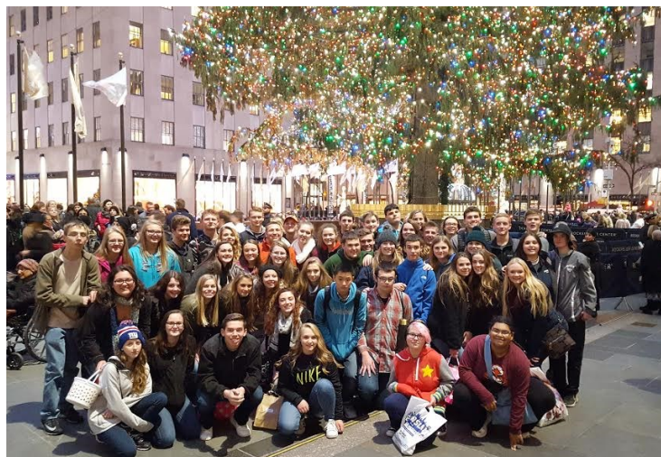
Junior Honor Society, Senior Honor Society, and FBLA Trip to NYC—December 2016