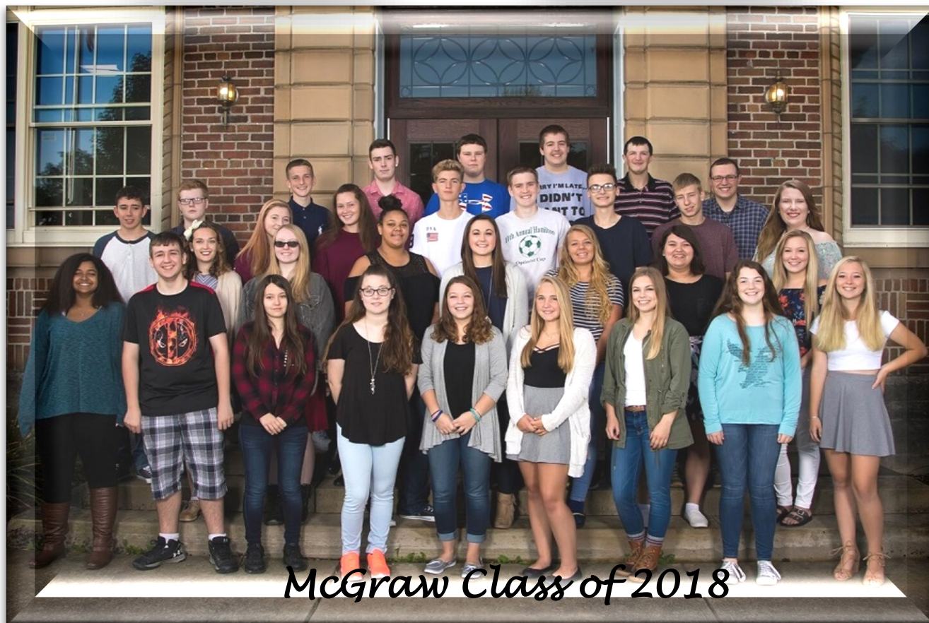
McGraw Class of 2018